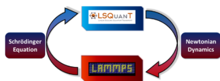
Fig. 1. Schematic representation of the self-consistency cycle for the atomistic simulation of coupled charge and ion dynamics

In this talk, we present our development of a numerical simulation tool that can capture the dynamics of hot carriers in graphene with arbitrary lattice vibrations, defects, and disorder. Our methods are linear-scaling, meaning we can simulate systems with millions of atoms – this permits an atomic description of the system while allowing for system sizes that approach the experimental scale. Such a tool will allow for a deeper fundamental understanding of hot carrier dynamics in graphene, as well as reveal strategies for the control of such dynamics, with an eye toward future applications in photodetection, optical communications, and energy conversion.